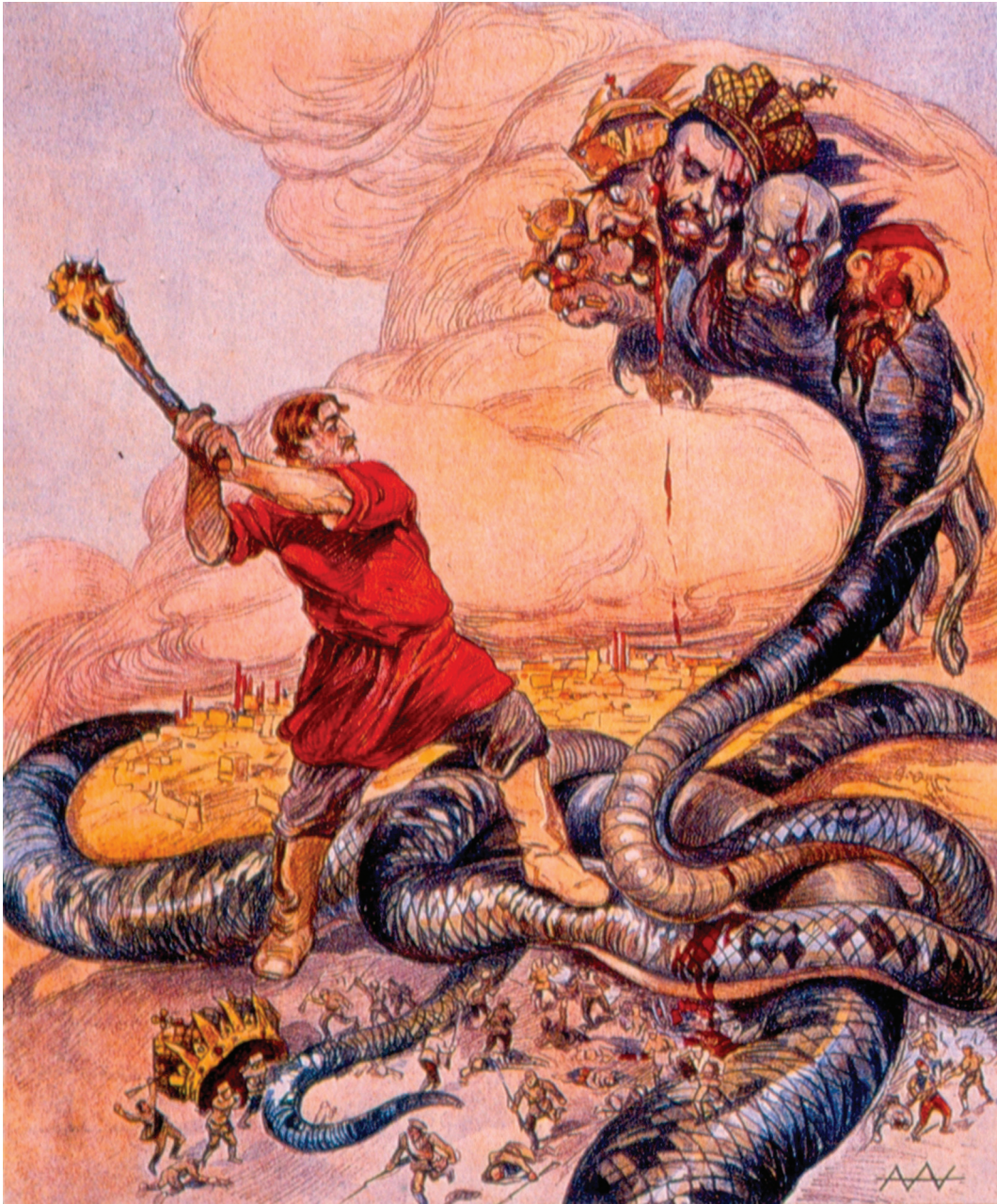
A Communist poster of 1918 showing the Red Army fighting the Whites.